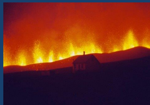
Heimaey eruption in 1973.

After the formal conference, interested participants can join a field excursion on September 13 th -14 th to the Eyjafjallajökull and Vestmanneyjar volcanoes in southern Iceland. The Eyjafjallajökull eruption closed much of European air space for a week in mid-April 2010 and polluted the local environment. The Vestmanneyjar Eldfell volcano erupted just east of the fishing village in January 1973. A large part of the village was buried in volcanic ash and lava and volcanic gases, mostly CO 2 , was released. However most of the inhabitants returned to the island after the eruption to discover that the new lava significantly improved the harbor and the heat from the lava was harnessed for central heating for over 30 years after the eruption.